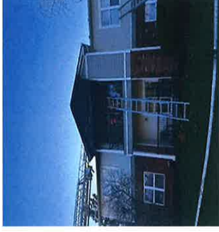
(Mallard Crossing Structure fire)

As an essential component of our 2025 capital improvement plan, we are prioritizing the acquisition of new SCBA. To ensure a precise and comprehensive selection process that aligns with the needs of DTFR, we have formed a committee comprising representatives from all three shifts. This committee will kick off its efforts in May, embarking on a thorough evaluation to identify the most suitable SCBA for our department