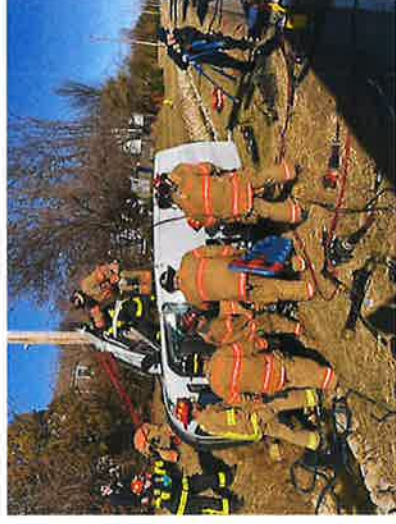
(Butler Warren MVA with entrapment)

It's worth noting that NFPA 1971 establishes guidelines for structural firefighting, including a 10-year end-of-life standard for turnout gear. In light of this, we are now coordinating with Scarlet Oaks to donate these sets of gear and helmets. Although they may no longer meet the stringent requirements for structural firefighting, they can still serve valuable roles in other firefighting activities and training exercises. This collaboration reflects our commitment to supporting the development of aspiring firefighters and enhancing safety within our community.