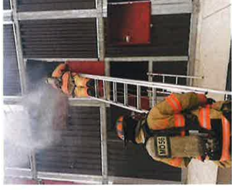
(VES training at the joint training tower)

DTFR and the City of Mason Fire Department have upheld their commitment to regular training sessions. Throughout the first quarter, members from both departments actively participated in confined space training exercises and multi-company drills. These joint efforts underscore the dedication of both departments in maintaining preparedness and enhancing operational effectiveness through shared training opportunities.