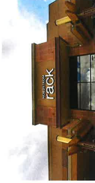
Coming to Deerfield Towne Center in 2024